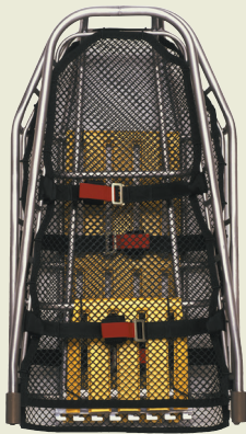
TITAN Tapered Split TITAN 32 TITAN Regular TITAN Tapered

So easy to handle – in stainless steel or ultra-lightweight titanium – even when you need to carry a casualty over longer distances