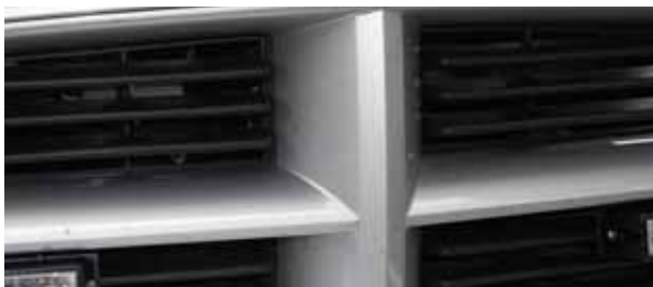
Dodge Charger with vehicle specific mounting of SA315P in grille.

SA315P ..... 123dB speaker, nylon composite