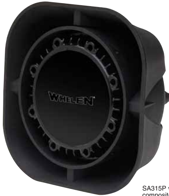
SA315P with nylon composite housing

Smaller size speaker with full size performance will mount in more locations than ever before.