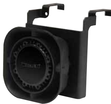
SA315P with mounting bracket.

SAK32 ..... Ford E350/E450, 2008-2009, Driver or Passenger Side