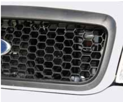
SA315P with vehicle specific mounting in grille of Crown Victoria.

Complies with OSHA 1910.95 guidelines regarding "Permissible Noise Exposure".