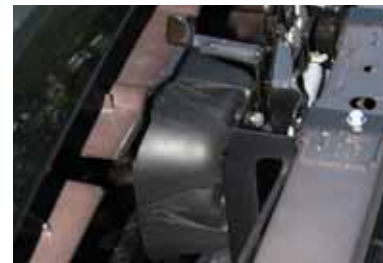
Photo shows mounting placement of SA315P between grille and radiator.